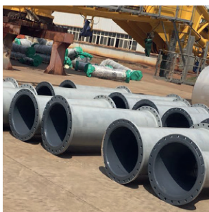
Ballast water piping