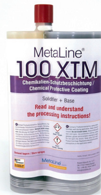
MetaLine 100 XTM Spray Cartridge (1.25 kg / 2.75 lbs)