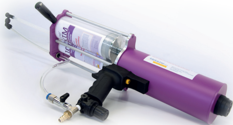
MetaLine APPLICATOR XTM

MetaLine's experience in cartridge spray processing dates back to the end of the 1990s – our invention and our pride and joy as the pioneer in cartridge-based spray processing!